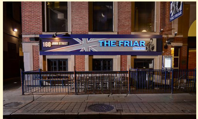
The Friar, a Firkin Pub

Co-sponsor: Cultural and Critical Studies