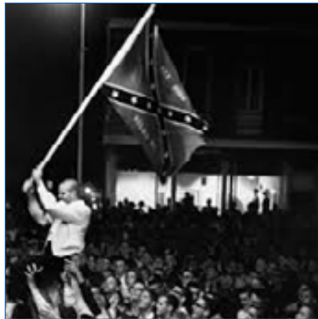
Rebel flag