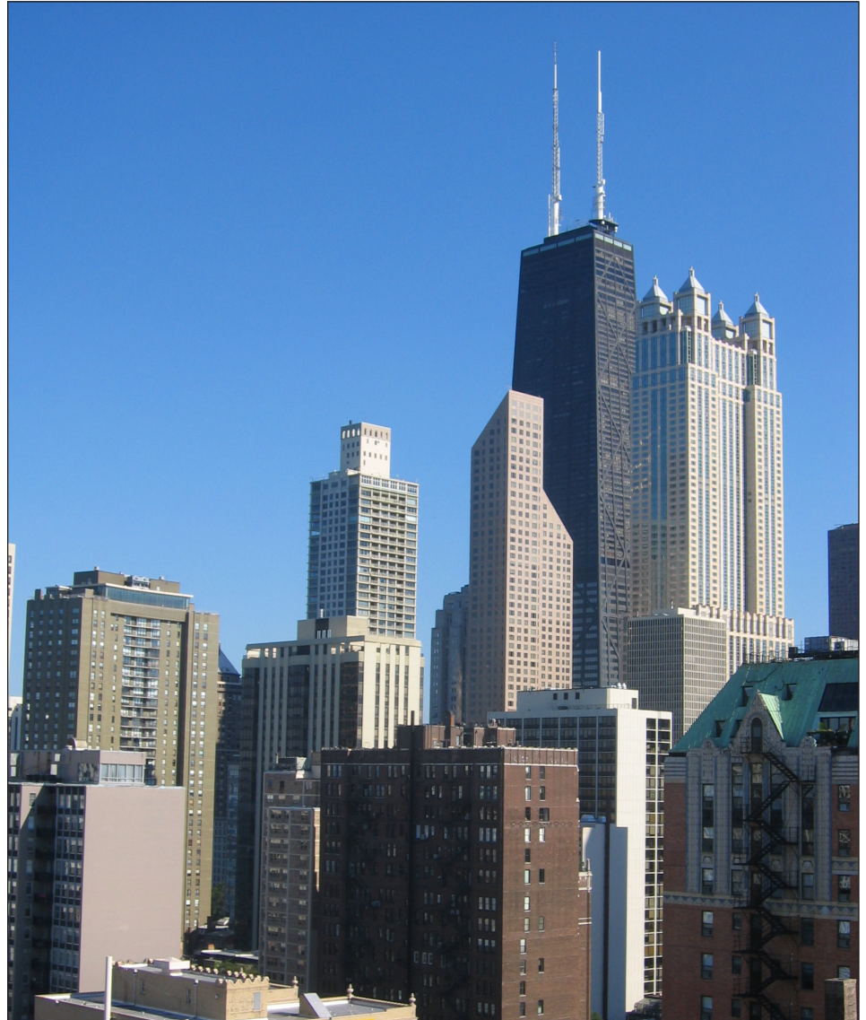
The John Hancock Center is one of the tallest buildings in Chicago and is near the Magnificent Mile neighborhood of downtown, where the conference is hosted.

The accepted submissions were grouped by theme into three traditional research sessions and two poster sessions. On Thursday, August 9th, a research session on "African-American Voices, Viewpoints, and Historical Perspectives on Race" is scheduled for 3:15 to 4:45 pm. A research session on "World War II Reporting" will take place on Friday, August 10 from 8:15 – 9:45 am. The