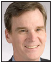
Teaching Chair Univ. of Missouri

Hog Butcher for the World, Tool Maker, Stacker of Wheat, Player with Railroads and the Nation's Freight Handler; Stormy, husky, brawling, City of the Big Shoulders