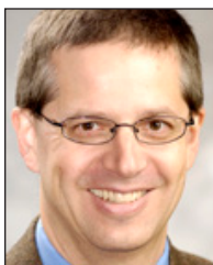
Chair Univ. of Missouri

point where a wide range of theorists in journalism and mass communication – including social scientists – see the need to better historicize our theories. This creates an enormous opportunity for journalism and mass communication historians to better connect with other theorists in our own discipline.