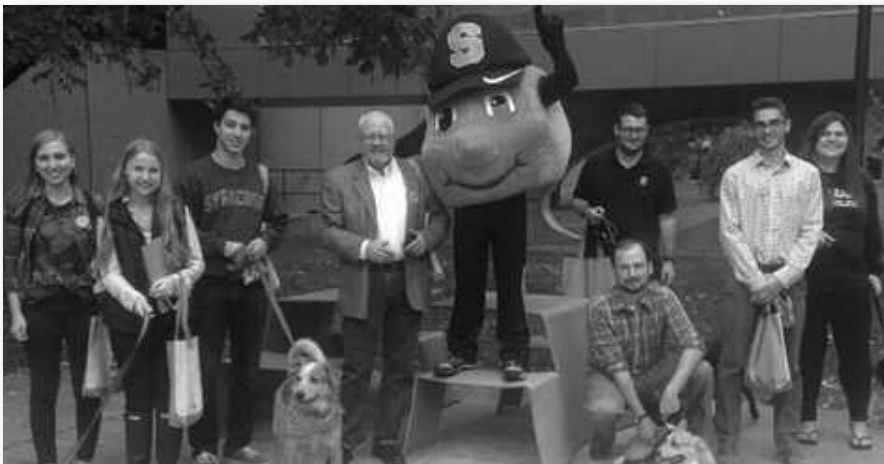
Otto the Orange, Newhouse newshounds, students and faculty celebrate News Engagement Day at Syracuse University.