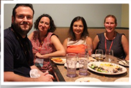
Social at Busboys and Poets in DC.

I am happy to report that our division membership level is quite healthy. That said, we are always keen on welcoming new members. If you have ideas and suggestions about how to grow the division, please do share it with us. And, of course, be sure to encourage your friends and colleagues to join. If you are not a member, please become one.