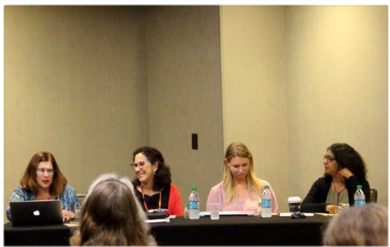
Panel: Has Feminist Communication Theory Changed Journalism and Mass Communication Research—and Should It?

We had an exciting, engaging, and well-attended AEJMC conference in DC evident in the abundance of high-quality panels and papers that were submitted to our division by members and non-members. CCS cosponsored eight panels with eight different divisions. It included a wide variety of topics that addressed issues related to the past, present, and future. You probably attended one or more of the panels that we co-sponsored.