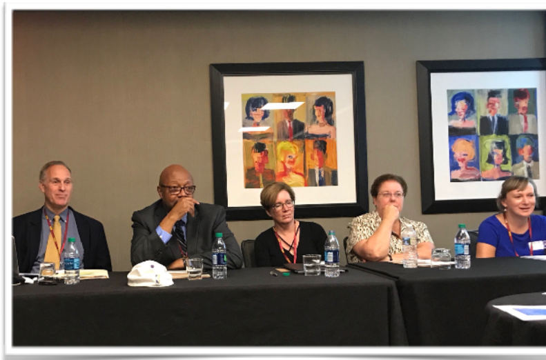
Panel: Reading Between the Lies: Addressing a Lack of Truth in Today's Political Discourse

Submit your abstracts of 600 to 800 words, excluding references, to the conference website: http://bit.ly/midwinter19 .