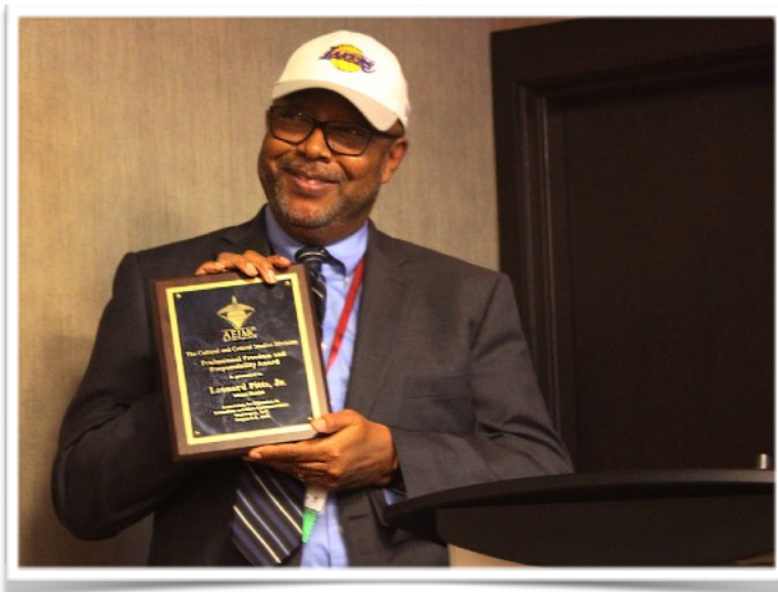
Leonard Pitts Jr., winner of the 2018 PF&R Award.

He is a three-time recipient of the National Association of Black Journalists' Award of Excellence and was chosen NABJ's 2008 Journalist of the Year. In 2002, the National Society of Newspaper Columnists awarded Pitts its inaugural Columnist of the Year award. In 2002 and in 2009, GLAAD Media awarded Pitts the Outstanding Newspaper Columnist award. Pitts maintains a rigorous speaking schedule that has taken him to colleges, civic groups and professional associations all over the country. He has taught at Hampton University, Ohio University, the University of Maryland, Princeton, George Washington and Virginia Commonwealth. Twice each week, millions of newspaper readers around the country seek out his rich and uncommonly resonant voice. (Compiled from http://www.leonardpittsjr.com/Biography.html )