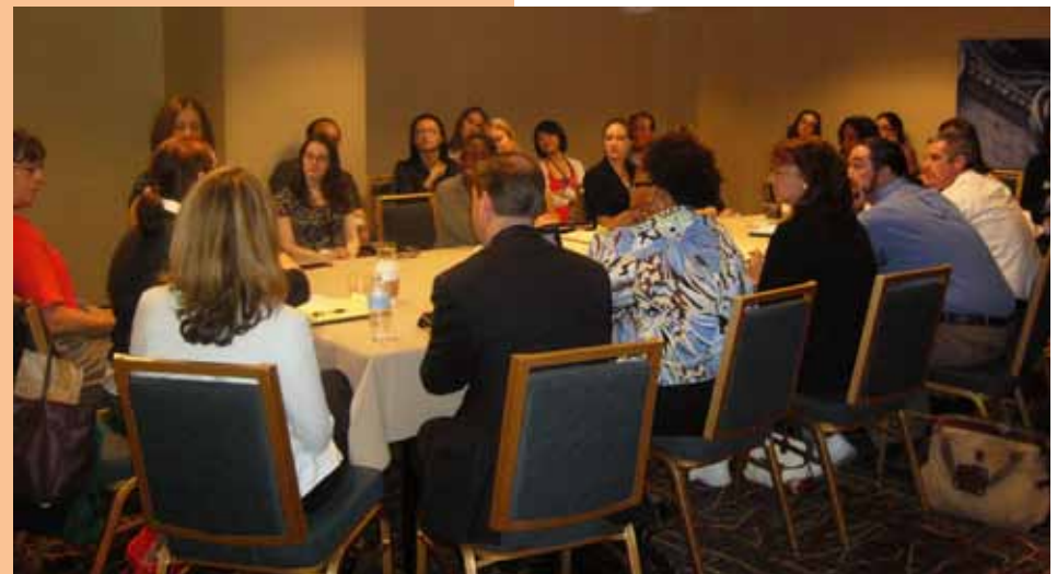
Incoming officers meeting