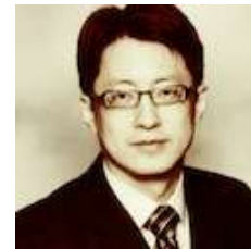
Award Committee Co-Chair