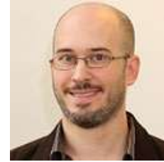
Teaching Committee Co-Chair