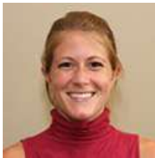
Teaching Committee Co-Chair