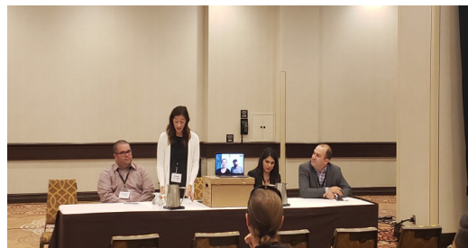
2019 CT&M Business Meeting