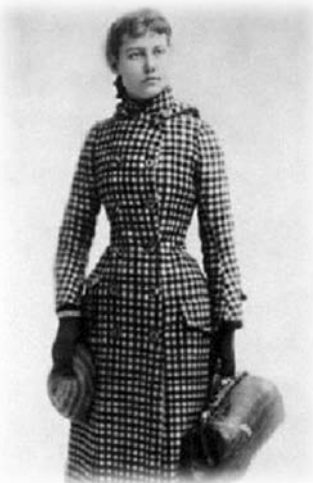
Nellie Bly 1864 - 1922 Pioneer Woman Investigative Journalist

An associate professor at Central Michigan University is seeking help in locating obscure women reporters - particularly from the 1800s - whose writings need to be shared.