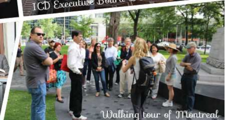
Walking tour of Montreal

For more pictures from AEJMC 2014 in Montreal, go to ICD Facebook page (search for International Communication Division of AEJMC).