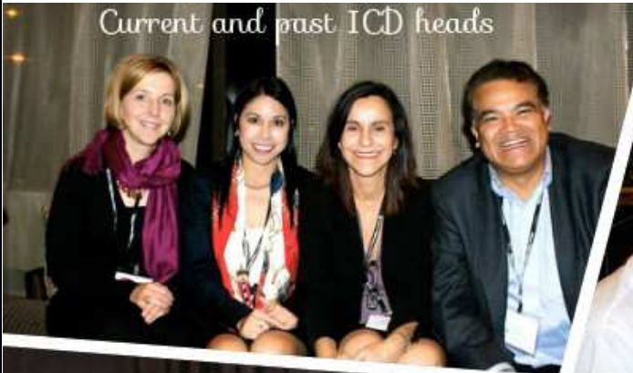
Current and past ICD heads