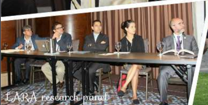
LARA research panel