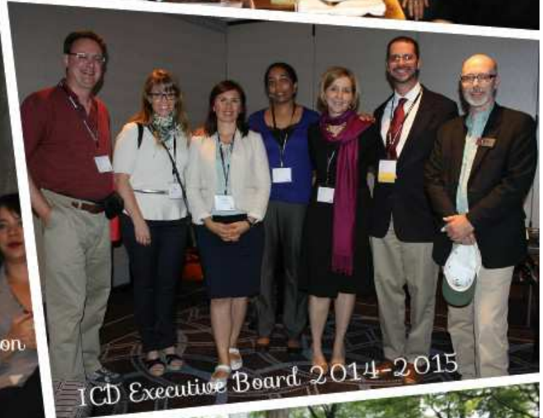
ICD Executive Board 2014-2015