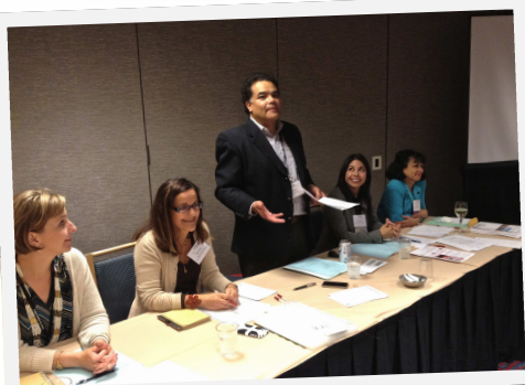
ICD officers at the ICD business meeting