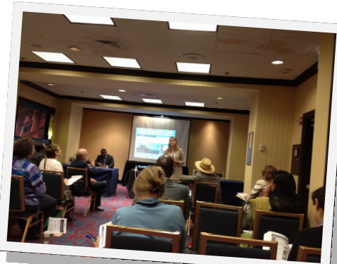
Amy Schmitz Weiss coordinating the UNESCO panel