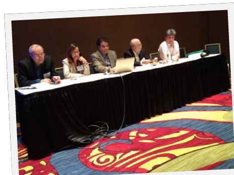
ICD Centennial panel