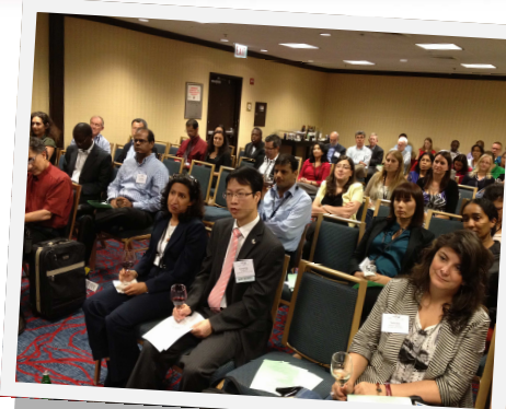
ICD business meeting