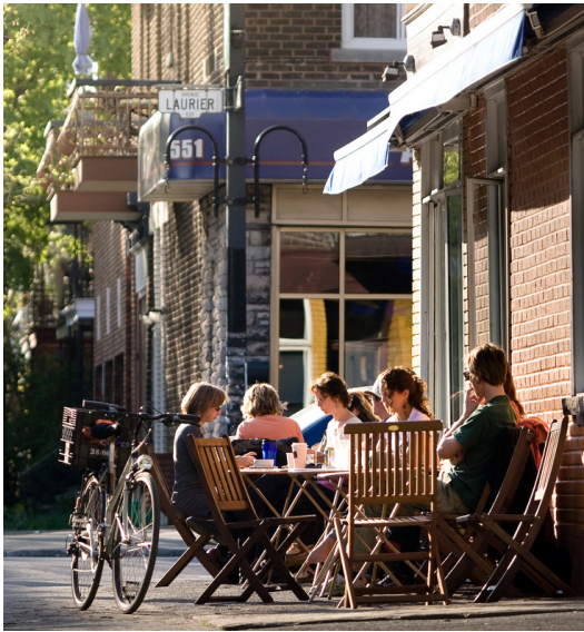
Francois Hogue / Creative Commons