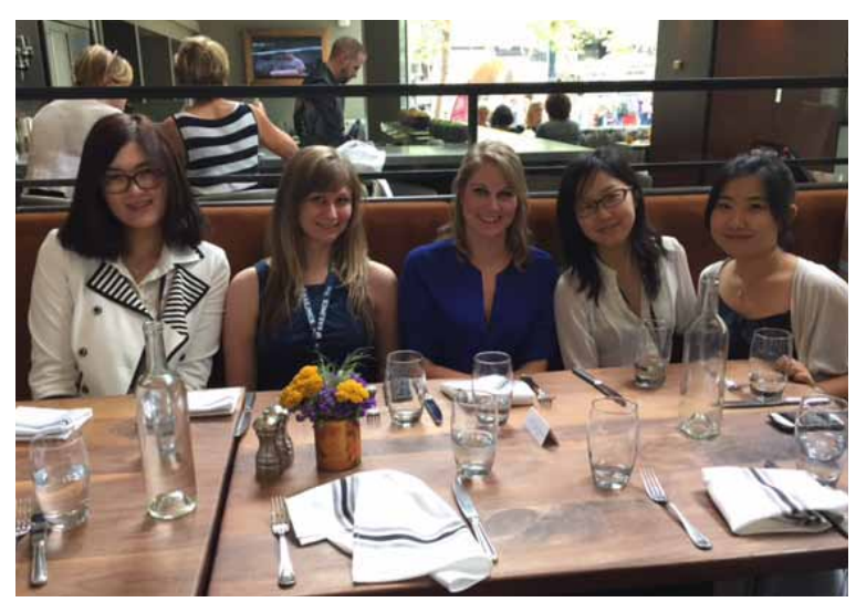
Graduate students gather for the first-ever graduate student luncheon.