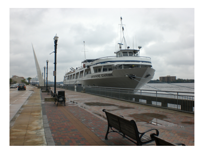
Jacksonville, Florida harbor