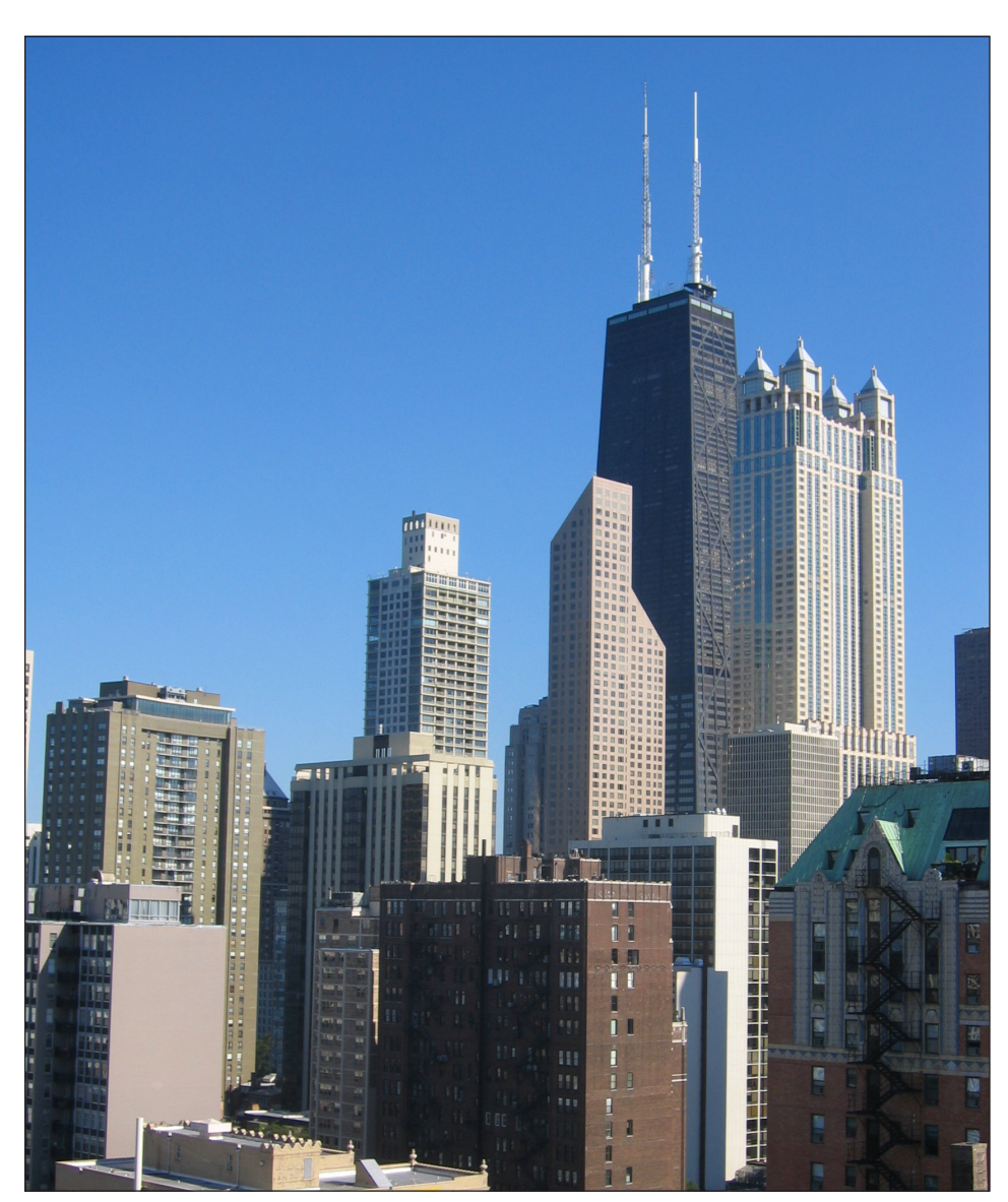
The John Hancock Center is one of the tallest buildings in Chicago and is near the Magnificent Mile neighborhood of downtown, where the conference is hosted.

The accepted submissions were grouped by theme into three traditional research sessions and two poster sessions. On Thursday, August 9th, a research session on "African-American Voices, Viewpoints, and Historical Perspectives on Race" is scheduled for 3:15 to 4:45 pm. A research session on "World War II Reporting" will take place on Friday, August 10 from 8:15 – 9:45 am. The