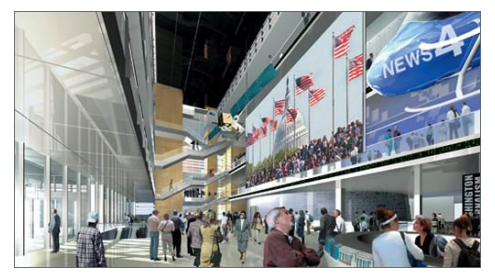
Coming soon: The new Newseum

A striking and emblematic feature of the Newseum is the inscription