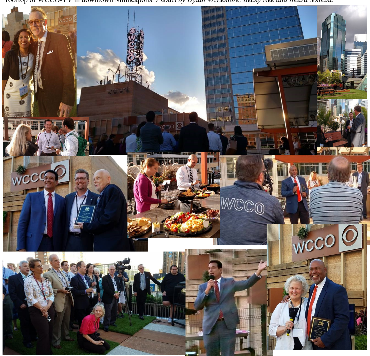
More photos available in our Facebook Group. Search for "enewsdivision."

The Electronic News Division met for its 50th anniversary celebration and award presentation Friday, August 5, on the rooftop of WCCO-TV in downtown Minneapolis.