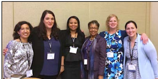
The 2015 AEJMC panel on the Images of Great Women.